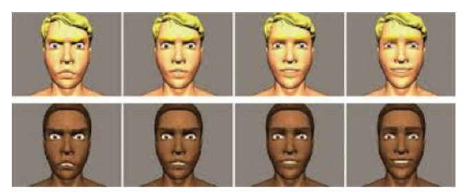
FIGURE 1. SAMPLE FACIAL EXPRESSION TEST

This behavior ranges from perceiving facial expressions differently to offering job callbacks at different rates to seeing guns more quickly in relation to some racial groups relative to others. Specifically, in studies of facial expressions, whites with stronger implicit racial bias perceive black faces as angrier than whites with weaker levels of bias; similarly, those with stronger implicit bias are apt to consider an expression happy or neutral if displayed by a white person, but neutral or angry if displayed by a black person (Hugenberg & Bodenhausen, 2003).