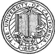
THE UNIVERSITY OF CALIFORNIA